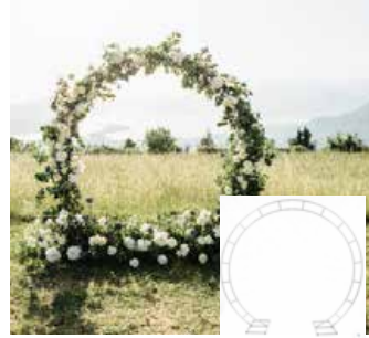
White Round Arbor (no plinth or florals) @ $180 (2.2m x 2.4m)