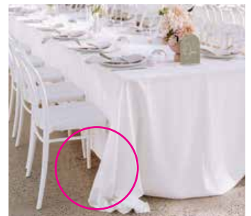
White Table Cloth full length @ $35 each | 220cm x 330cm