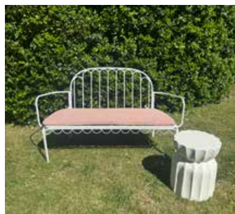
French Provincial Lounge each @ $180 (2 sets available)