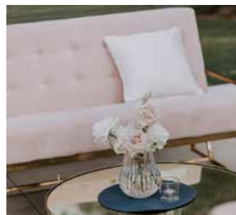
Blush Velvet Lounge set @ $350 (1x velvet lounge 3 seater, 2 velvet chairs, 2 cushions, 1 golden coffee table)