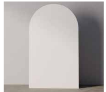
White arch backdrop and/or white ripple plinth @ $150 | $250