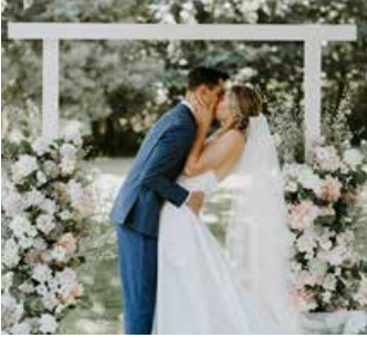
White Arbor @ $150

Looking for a few extra styling items, save on unnecessary delivery, it's all in house and include set up & install!