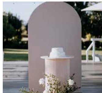
Blush ripple arch backdrop and/or plinth @ $150 | $250