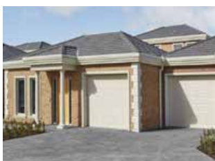
The Mansi on Raymond