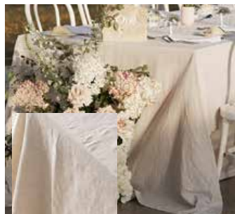
Belgium Linen Table Cloth Oatmeal @ $45 each