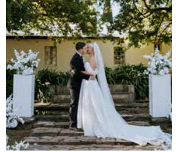
White Plinth set of 2 @ $150