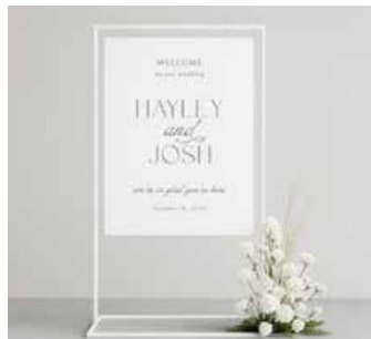
White Metal Frame @ $50