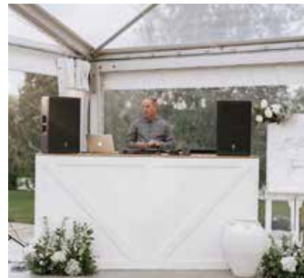
White DJ Bar @ $200