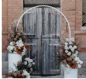
Arch Arbor (no plinth or florals) @ $150