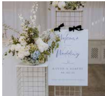
White mesh pillars set of 2 @ $150 / set of 4 @ $220