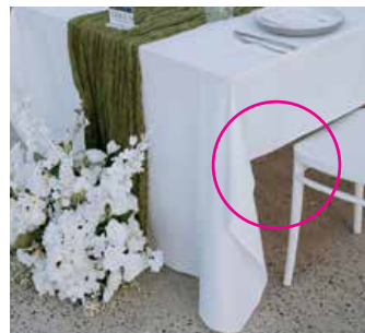
White Table Cloth half length @ $30 each | 153cm x 330cm