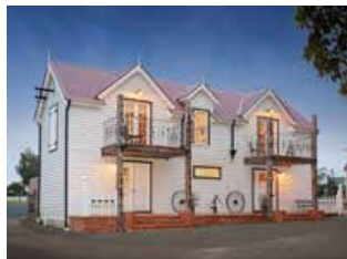
Duart Homestead Stables