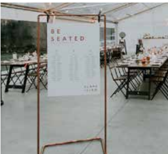
Copper Metal Frame @ $50