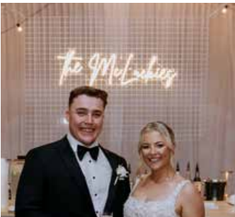
White Wire mesh for your sign standing or hanging @ $130