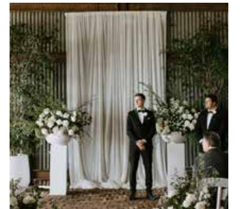
Wet Weather white curtain @ $200