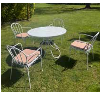
French Provincial table & chairs set each @ $180 (2 sets available)