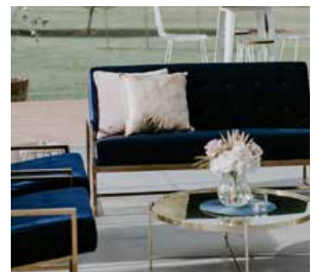
Navy Velvet Lounge set @ $350 (1x velvet lounge 2 seater, 2 velvet ottomans, 2 cushions, 1 golden coffee table)