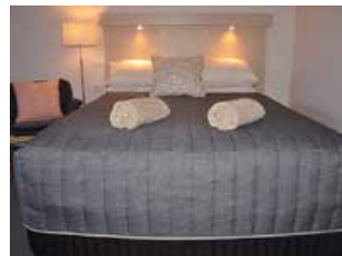
Maffra Motor Inn