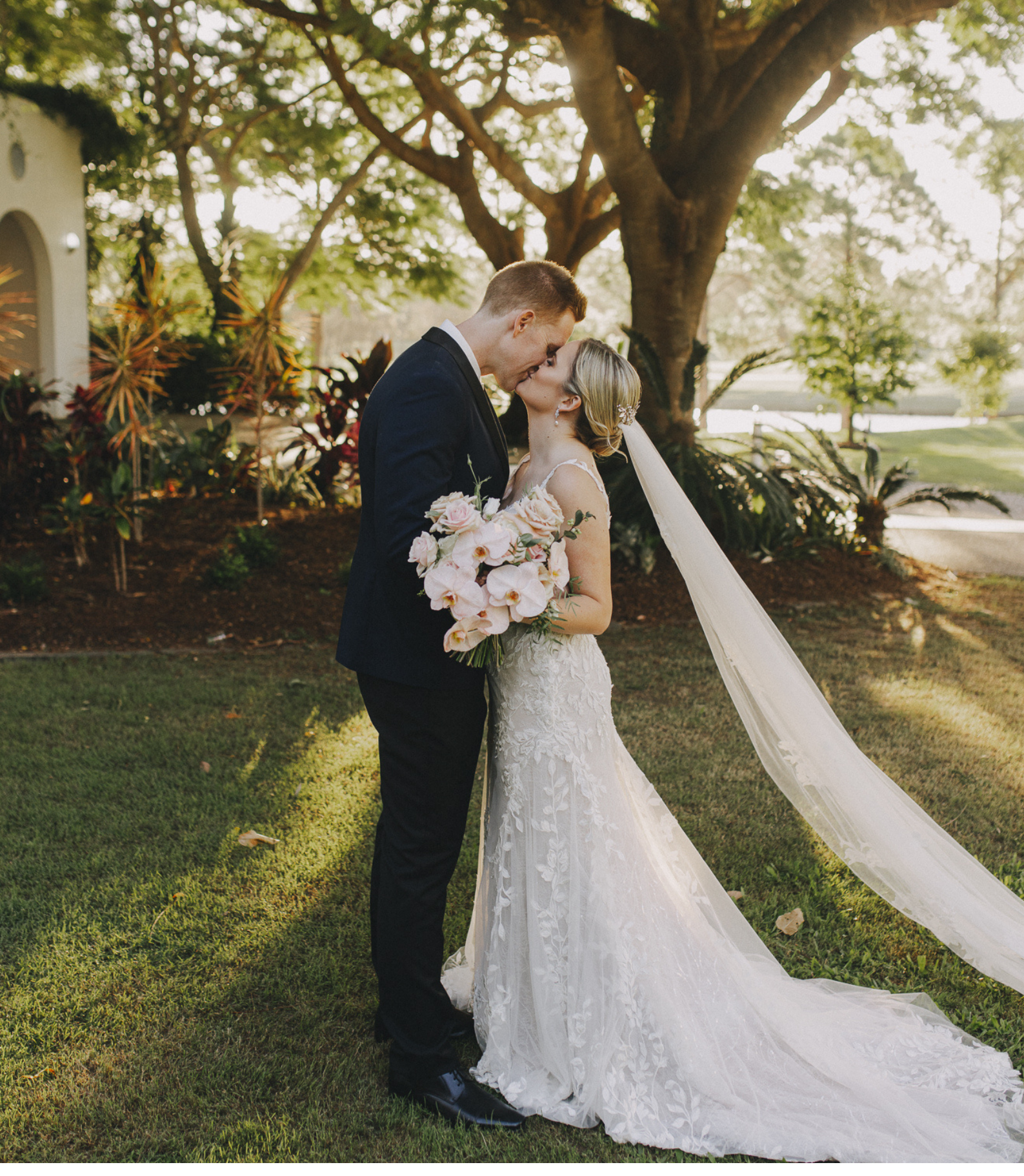
RACV Royal Pines Resort Wedding Packages RACV