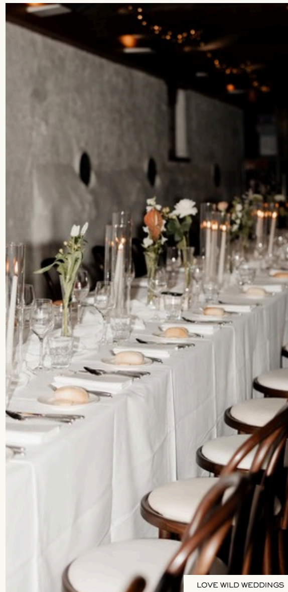
LOVE WILD WEDDINGS

REFER TO FINER DETAILS FOR FULL LIST OF INCLUSIONS.