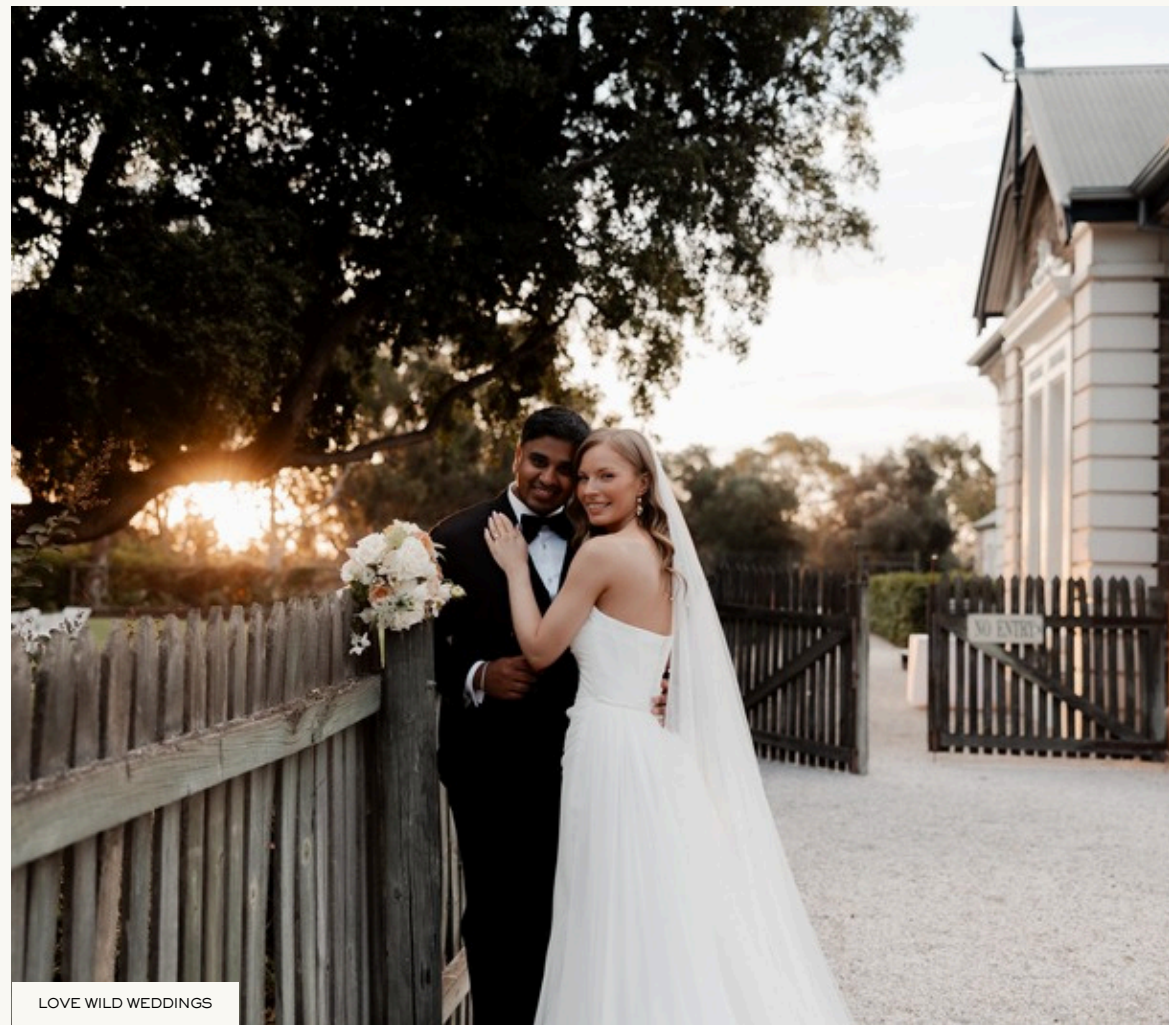
LOVE WILD WEDDINGS

Surrounded by vineyards, stunning gardens and buildings steeped in history, this is the place where love is honoured, stories begin and memories are made to last a lifetime. Whether you envision an intimate gathering or a grand celebration, our stunning spaces, award-winning wines and delicious cuisine will bring your wedding vision to life with creativity, care and exceptional hospitality.