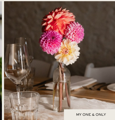
MY ONE & ONLY