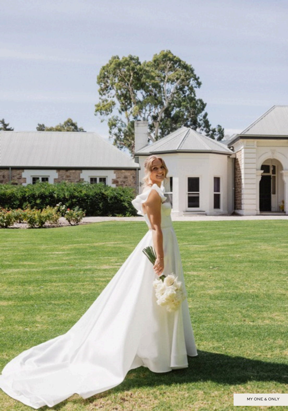
MY ONE & ONLY