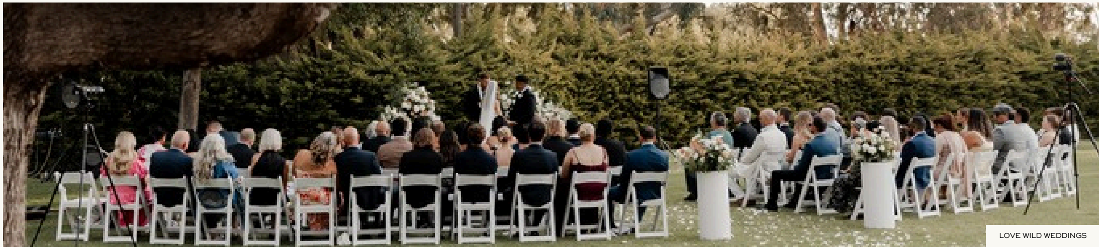
LOVE WILD WEDDINGS