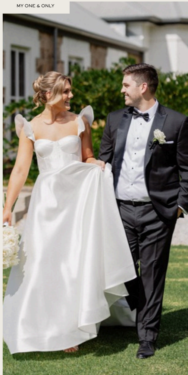
MY ONE & ONLY