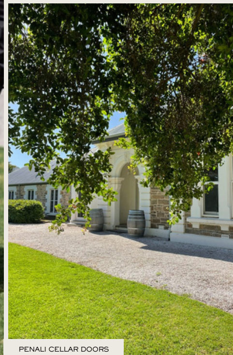
PENALI CELLAR DOORS