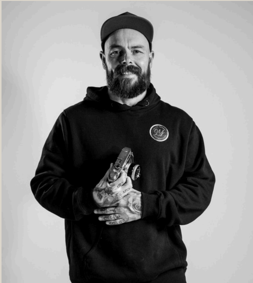
A creative bloke who still believes in love.