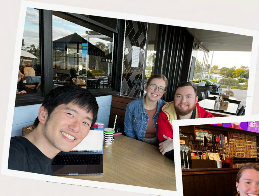
Planning our wedding timeline with my couple ▶