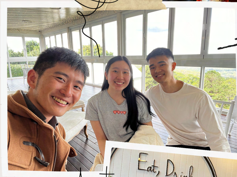
◀ Meeting my couple at the wedding venue for rehearsal