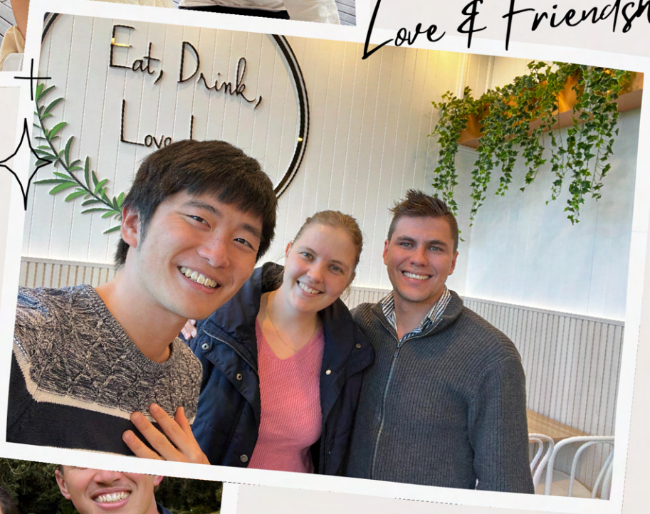
Staying connected with my couple after the wedding ▶