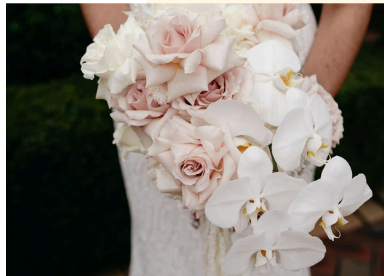
Blush & Whites

We're particularly excited to see any inspiration images you have at this stage. They play a pivotal role in helping us understand your style and preferences. Sharing these with us ensures that we can tailor our services to perfectly match your needs.