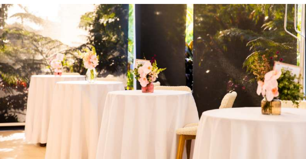
Menus are subject to seasonal change